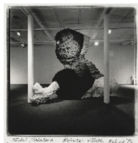
Reference Image: Kodai Nakahara, Untitled (Lego Monster) , 1990 ©Kodai Nakahara, ©Estate of Shigeo ANZAI, 1990 Courtesy of ANZAI Photo Archive, The National Art Center, Tokyo

The exhibition shows how Japanese contemporary art during this critical transitional period examined and tackled major subjects, such as the nation's historical legacy and multiplicity of identities, while proposing possibilities of alternative communities. It also underscores the wide influence of Japanese art and visual culture in the first two decades of contemporary globalisation.