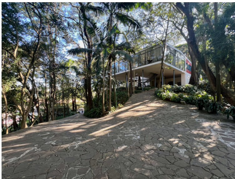
Lima Bo Bardi, Casa de Vidro , 1951

Organized by The National Art Center, Tokyo; The Tokyo Shimbun Japan Arts Council; Agency for Cultural Affairs, Government of Japan