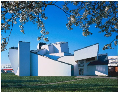
Vitra Design Museum, Frank Gehry, 1989, © Vitra Design Museum, photo: Thomas Dix

Since 1996, the Vitra Design Museum has organized the international muscon conference in cooperation with annually changing local hosts. The aim of this conference is to promote the international exchange of travelling exhibitions and other collaborative initiatives among museum professionals and decision makers. Outside of Europe muscon is also regularly held in the United States and Asia-Pacific. The muscon network has brought together several hundred institutions and contributed significantly to further a productive exchange of travelling exhibitions in the international museum landscape.